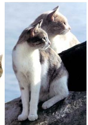
Dilute Torby and White (Blue Mackerel Torby and White)