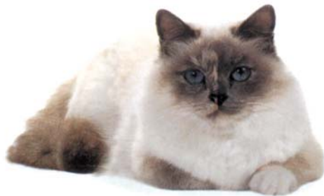
Tortie Point Tortoiseshell pattern on points.