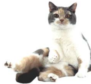
Dilute Calico Same amount of white as calico with distinct patches of solid blue and cream tabby.