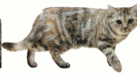
Dilute Torby (Blue Classic Torby) Patches of blue tabby and cream tabby.