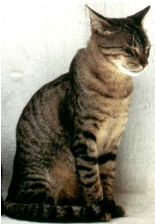
Brown Mackerel Tabby with Brown Field Black stripes with brown background.

Distinct color patterns with one color predominating. Black stripes ranging from coal black to brownish on a background of brown to gray. Brown mackerel tabbies are the most common.