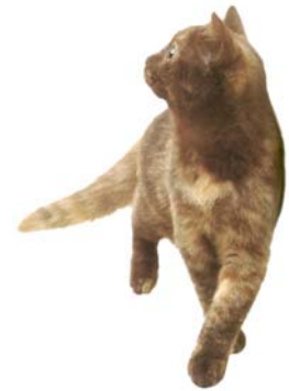
Chocolate Tortie Chocolate mingled with red and cream.