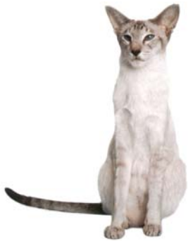
Tabby Point (Lilac Tabby Point) AKA Lynx Point Striped pattern on the points.