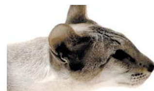
Tabby Point (Seal Tabby Point)