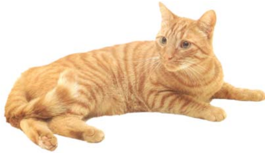
Mackerel Tabby (Red Mackerel Tabby)