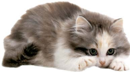
Dilute Tortie and White Small white areas with mingled blue, and cream colors.