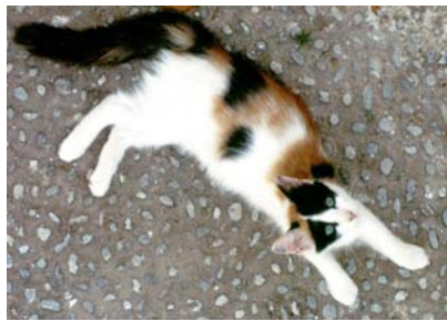
Calico Tortoiseshell with large patches of white. Red tabby and solid black patches more distinct.