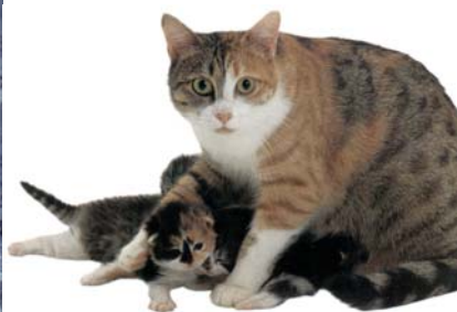
Brown Torby and White (Brown Spotted Torby and White)