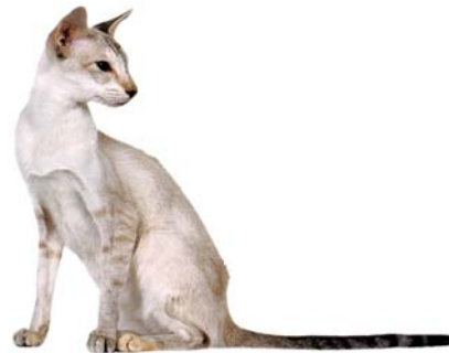
Torbie Point Both striped and tortoiseshell patterns on points.