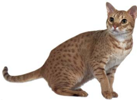
Spotted Tabby (Chocolate Spotted Tabby)