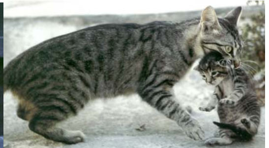
Brown Mackerel Tabby with Gray Field Black stripes with gray background.