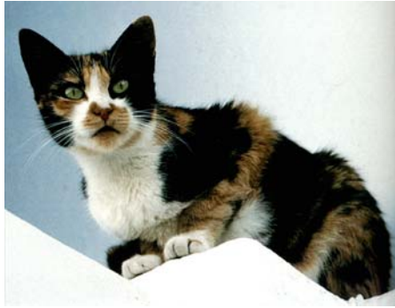
Tortie and White Small white areas with mingled red, black and cream colors.