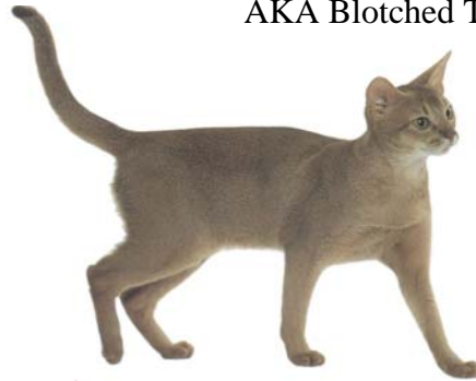
Ticked Tabby (Cinnamon Ticked Tabby)