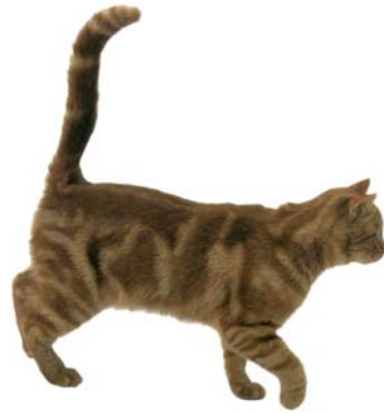
Classic Tabby (Chocolate Classic Tabby) AKA Blotched Tabby