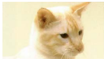
Tabby Point (Red Tabby Point)