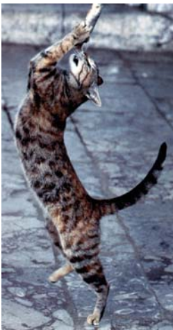
Brown Torby (Brown Spotted Torby) Patches of brown tabby and red tabby.

Tortoiseshell cats with tabby patterns. Torbies because of random color variation , but tabbies due to the patterns in the coloration. Torbies are also called patched tabbies.