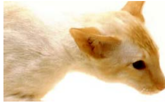
Red Point AKA Flame Point