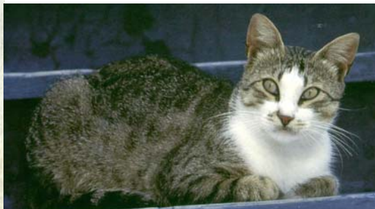
Brown Mackerel Tabby with Gray-Brown Field Black stripes with gray-brown background.